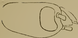
Fig. 1.— Termopsis Wroughtoni , side view of Imago's head. Ocelli wholly absent.

Eyes very large but not very prominent, close to the base of the antennæ, of quite unusual form amongst the Termitidæ: the anterior border being broadly emarginated so that the eye appears to be almost reniform (Fig. 1).